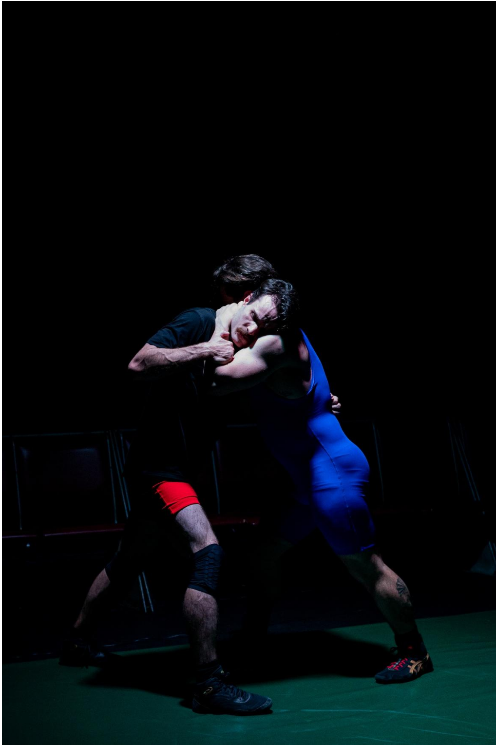
Taken as part of The Blue Room Theatre's annual 2025 season